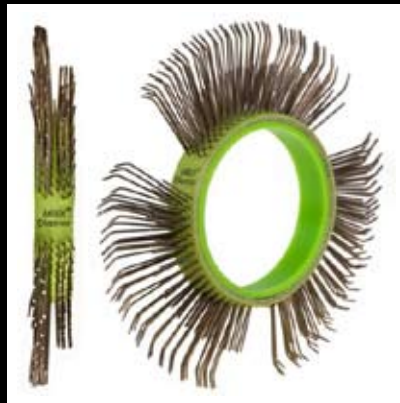
Belt for MBX ® Die Blaster ® , 11mm, Right: