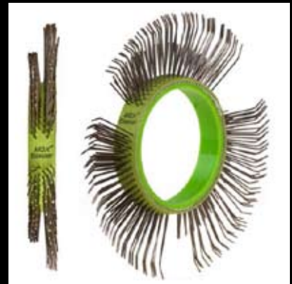
Belt for MBX ® Die Blaster ® , 11mm, Left: