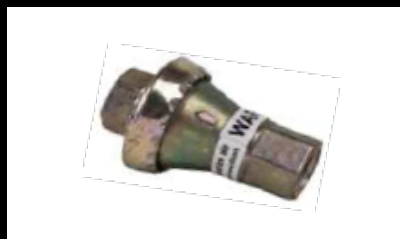
Air Pressure Regulator (already included with set SDB-001) Minimal pressure: 100 psi / 7,5 bar Maximal pressure: 170 psi / 18 bar