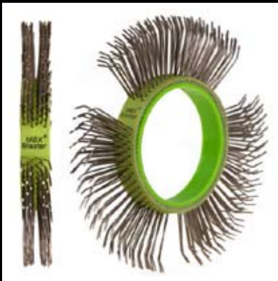
Belt for MBX ® Die Blaster ® , 11mm: