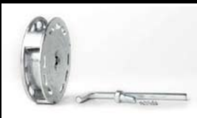
MBX ® Adaptor System: (already included with set SDB-001)