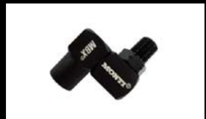
Swivel Connector (already included with set SDB-001)